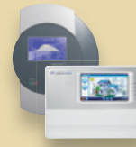
Solar-Log 500/1000™ and Meteocontrol WEB'log Comfort Accessories